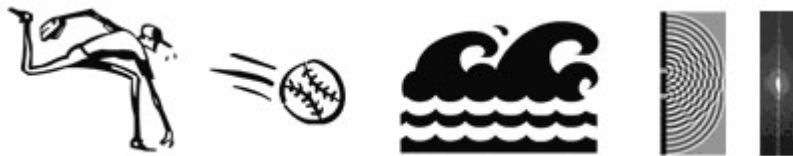
The photon goes through the double slit as a wave.

However, when we uncover both slits, then the particle suddenly behaves like a wave and we see an interference pattern on the wall on the other side.