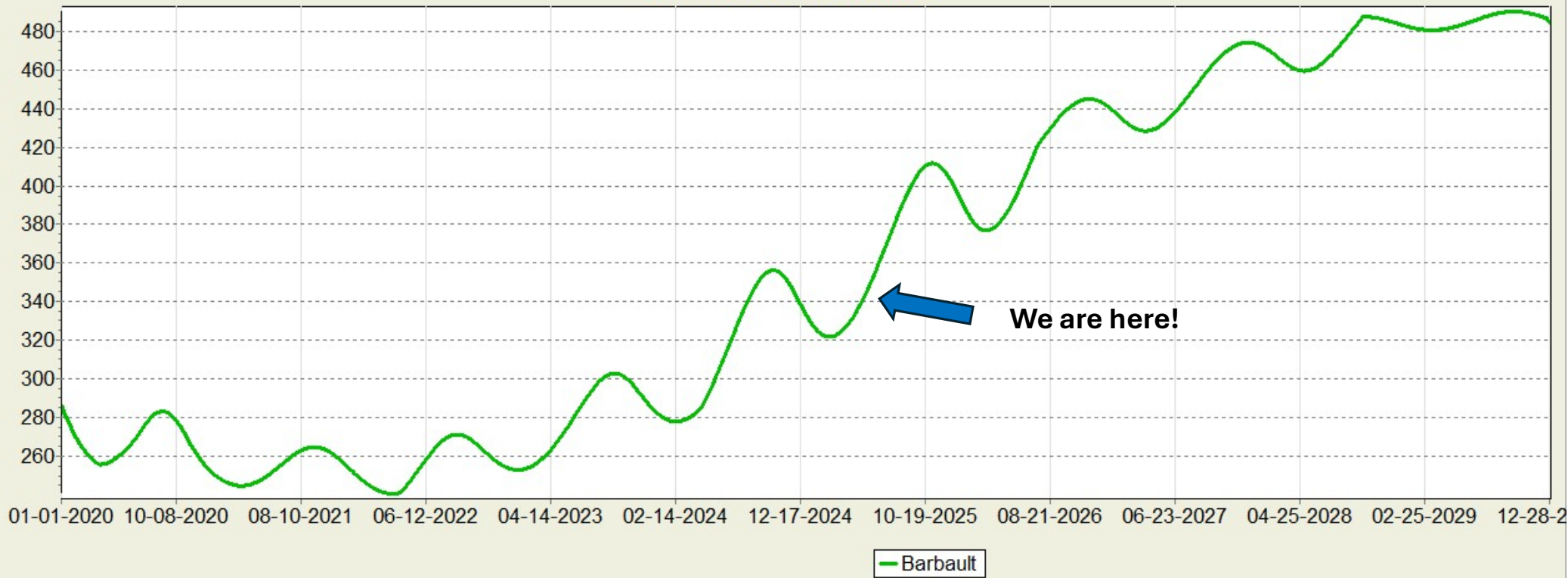
2020-2030 Electional Forecast

The Barbault Planetary Cycle Index suggests that things are looking up!